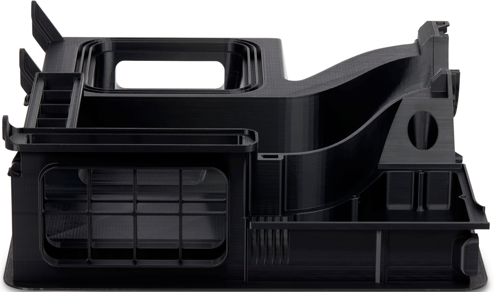
This home appliance base prototype measures nearly 600 mm wide by 600 mm deep (23 inches x 23 inches), testament to the F770's large build capacity.