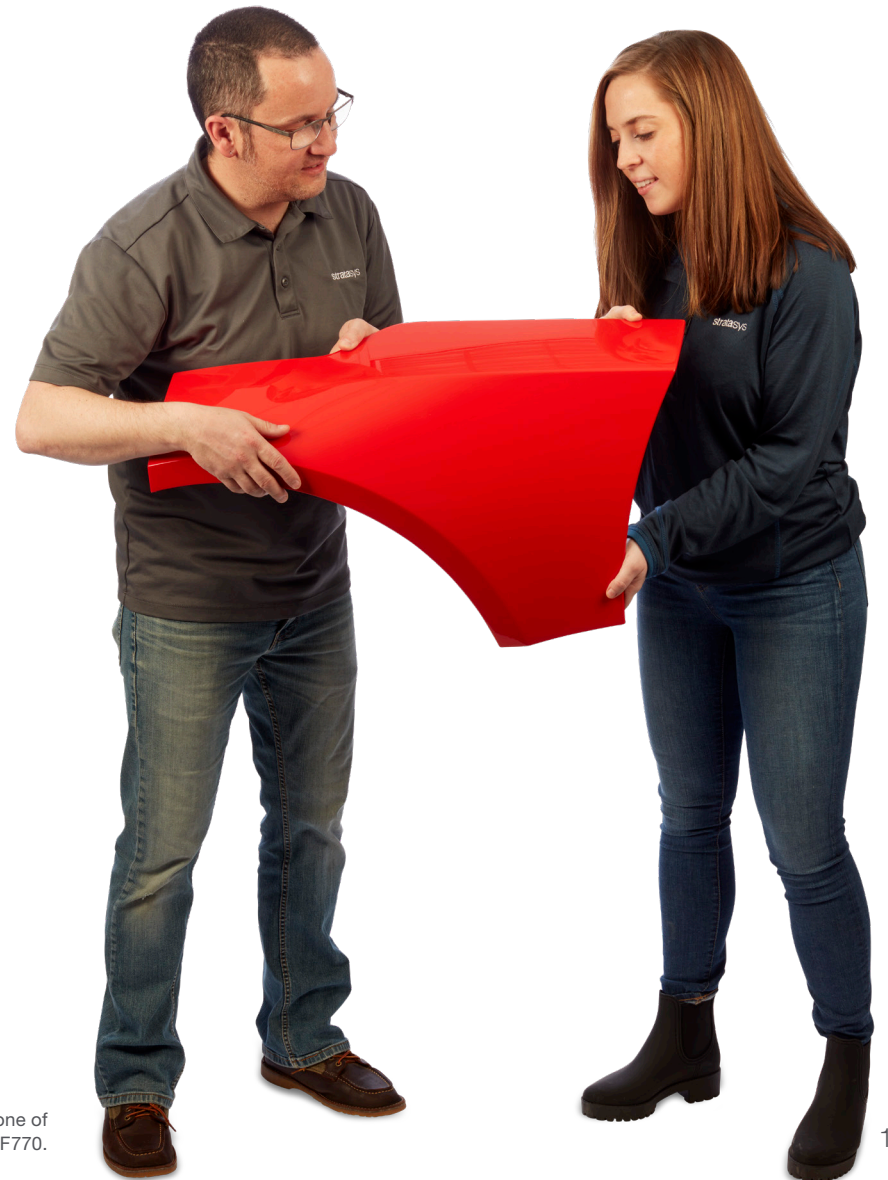
This painted 3D printed car fender illustrates just one of the many large-part applications served by the F770.

Instead, the F770 offers the opportunity to avoid that time and effort. It precludes having to stay with the slower, more expensive status quo of machining large prototypes and tooling fixtures or piecing parts together with smaller printers. Virtually any manufacturer that deals with larger tools and components can benefit from the F770's capabilities.